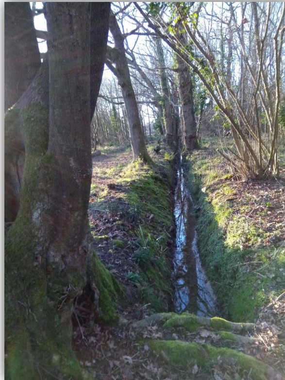
Wandleys Copse – Corridor 2

2. Wandleys Copse: This chalk stream emerges behind the houses in Wandleys Lane, flows past the Fontwell Copse remnant ancient woodland – rich in ancient woodland plant indicators and dormice. The stream passes close to open water and across farmland with diverse grassland and ponds – with watercress, wild iris and kingcups – with many species of bats having been recorded. The ponds support a range of reptile species and amphibia.