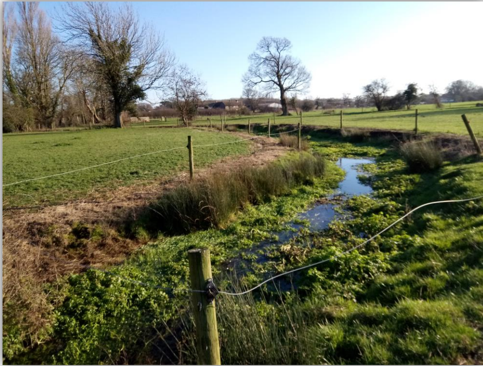
Choller Stream – Corridor 3

3. Copse Lane chalk streams: several streams come together as the streams emerge from areas of ancient woodland and old coppice near Clear Springs Farm and Copse Lane, with a number of small ponds, where kingfishers have been recorded. Barbastelle Bats use this as an unlit crossing of the A27 trunk road near Potwell Copse. The streams cross Eastergate Lane at Walberton Green and are associated with hedgerows and trees along their banks and connect with Stemps Wood woodland fishery and Nunny Copse. The chalk stream flows south into an important wildlife habitat south of Barnham Station.