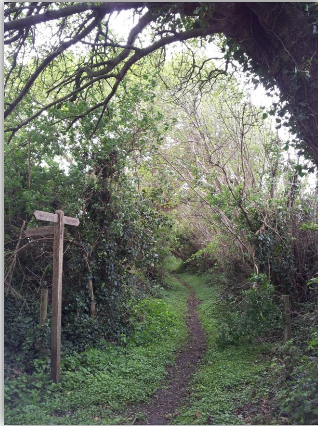
Hoe Lane, Binsted – Corridor 9

9. Lake Copse Connections: at the rear of Binsted Nursery, a replanted hedgerow (by volunteers) connects corridor no. 8 with Binsted Woods at Spinning Wheel Copse, Lake Copse and The Shaw; it then connects in to the wet woodlands by Manor House, then down Binsted Lane East and Hoe Lane sunken footpath.