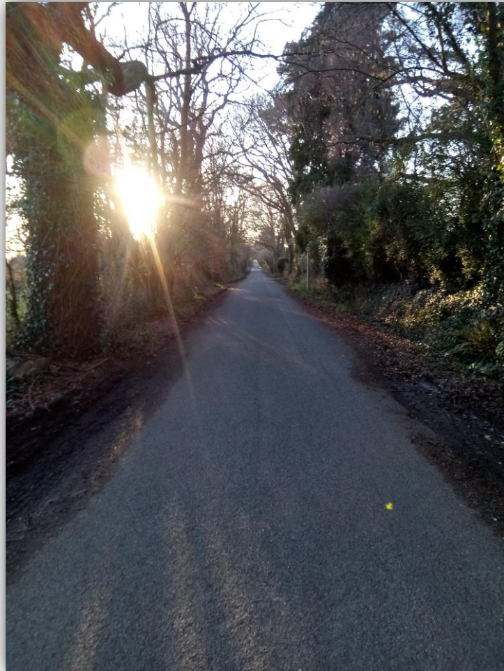
Wandleys Lane – Corridor 1

1. Wandleys Lane: The lane is lined with mature oaks and connects with Ash Beds ancient woodland in Slindon parish and provides a continuous route past the mature oaks on Woodfield Farm, to Barnham and the area around Eastergate Church. It is particularly important for the rare Barbastelle bats from the major maternity colony in Slindon.