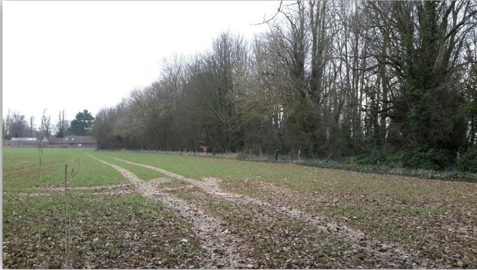
Woodland shaw, west side of Yapton Lane – Corridor 5

5. St Mary's Church and Walberton Park: a natural woodland corridor from St Mary's Churchyard, Walberton Park and a major stream down the side of woodland; this links with a dominant shaw (woodland belt) alongside Yapton Lane. The stream connects southwest to meet the previous corridor no. 4. There is a large well documented colony of soprano pipistrelle bats in the church roof. A rich environment running through intensive arable cultivation.