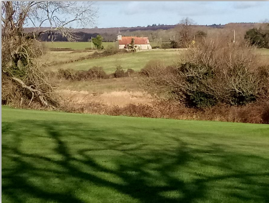
Binsted Valley – Corridor 7

7. Binsted Rife Valley: this chalk stream emerges from Hundred House Copse into open farmland where it forms a deep valley through the golf course and pasture land. A wet valley with many insects and feeding area for bats and birds, known as a “flushed fen” habitat. It flows south to connect with the wet grazing meadows of Marsh Farm.