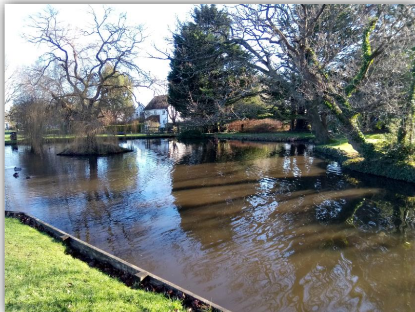
Walberton Pond – Corridor 2