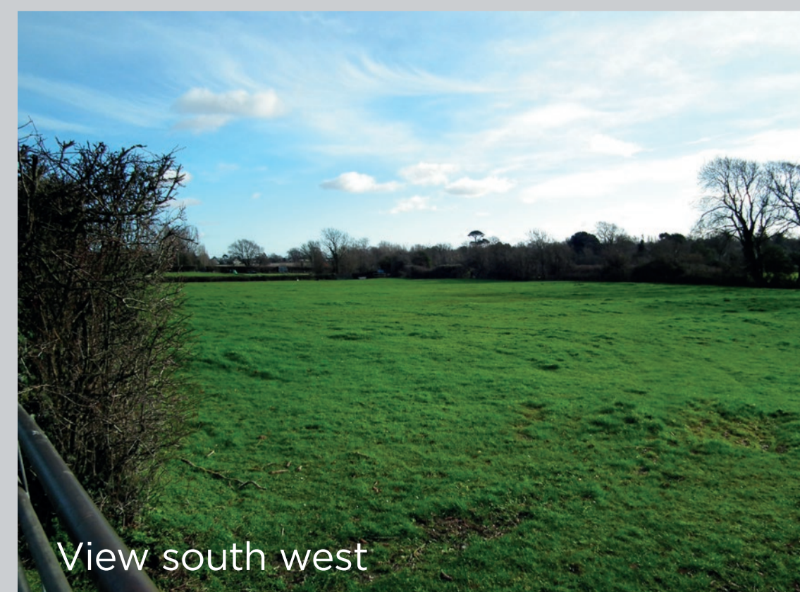
View south west