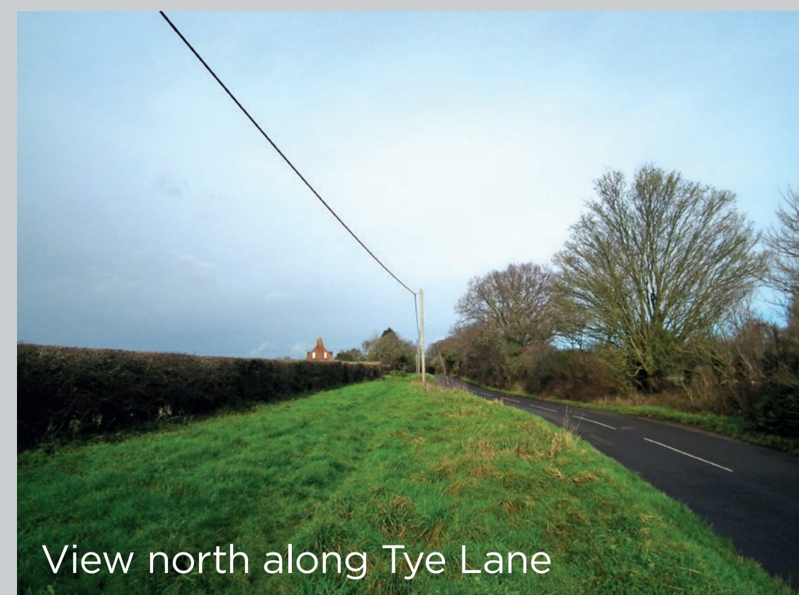
View north along Tye Lane