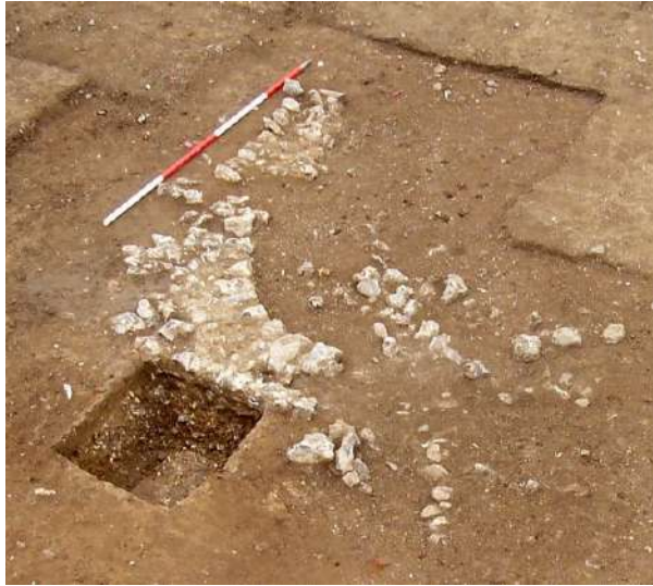
Figure 15: Trench B11 Apse Wall (facing north)

Trench B11 was located on and to the north of the apsidal wall (Fig. 15).