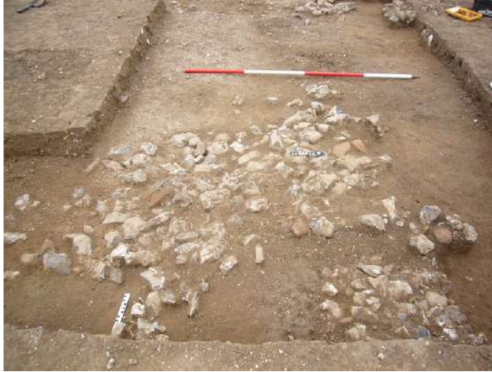
Figure 10: Trench B8 (facing west)

Directly to the east of the trench was a possible corridor wall similar to that exposed in the northern section of trench B7 and the southern section of trench B9. The trench was extended to the east towards the corridor wall where the spread of flints increased (Fig. 10).