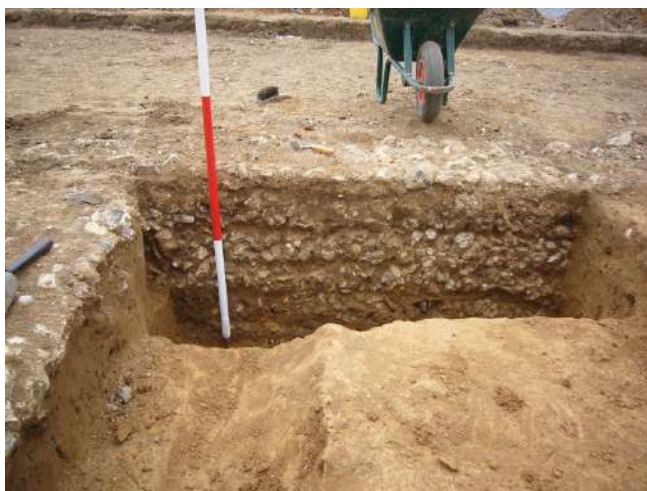
Figure 13: Trench B9 (facing west)

This 1.5m x 1.5m trench was located at the south western corner of room 3, against the west wall of the villa and the northern side of the north corridor wall exposed in trench B7 (Fig. 13).