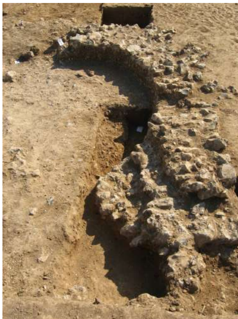
Figure 16: Trench B11 - Double Apse (facing south)

The flint rubble filling the apse was removed, and the area within the apse was taken down approximately 0.1m. When the area of the apse was cleared, the beginnings of a second apse were revealed (Fig. 16).