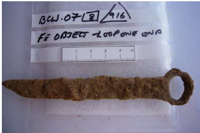
Figure 21: Toilet set implement (?) found in 2007