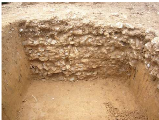
Figure 14: Trench B10 (facing west)

This 1m x 1m trench was located in the north western corner of room 2, against the west wall of the villa and the southern side of the south corridor wall exposed in trench B7 (Fig. 14).