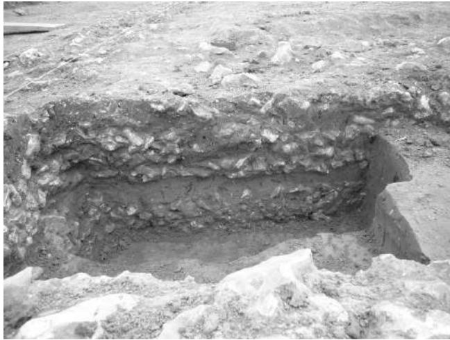
Figure 8: Trench B7 Southern corridor wall between rooms 2 & 3 (facing south)

The northern corridor wall was only one course of flints deep, and was not bonded into the eastern wall. In fact, it appeared to have the corners of the wall missing. It has been put forward that this wall may have been built with wooden posts in each corner, although there is no surviving evidence of any such posts.