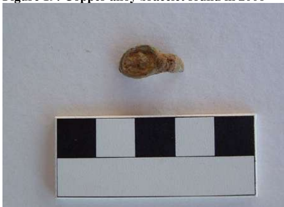
Figure 20: Ring fragment found in 2006