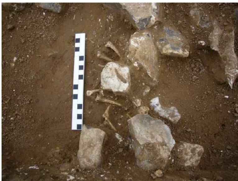
Figure 11: Chicken Skeleton (facing west)

To the east of the trench, under the rubble spread, was a partial articulated chicken skeleton (figs. 11 & 12).