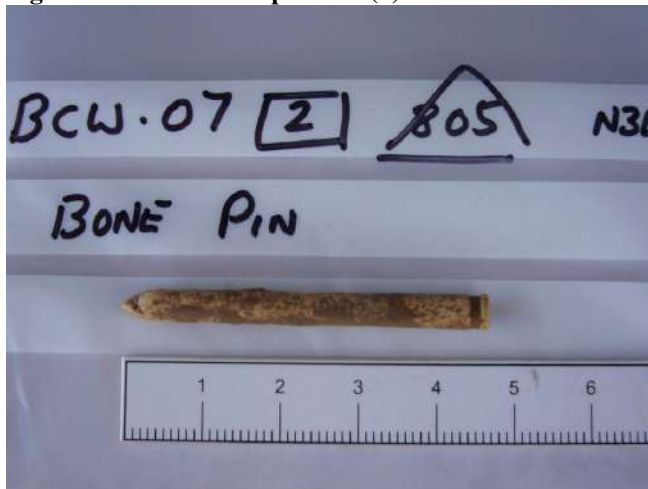
Figure 22: Bone pin found in 2007

More detailed analysis of the relative dating of the features of each trench is now underway, and we hope this will lead us to a tighter chronology of the life and demolition of the villa.