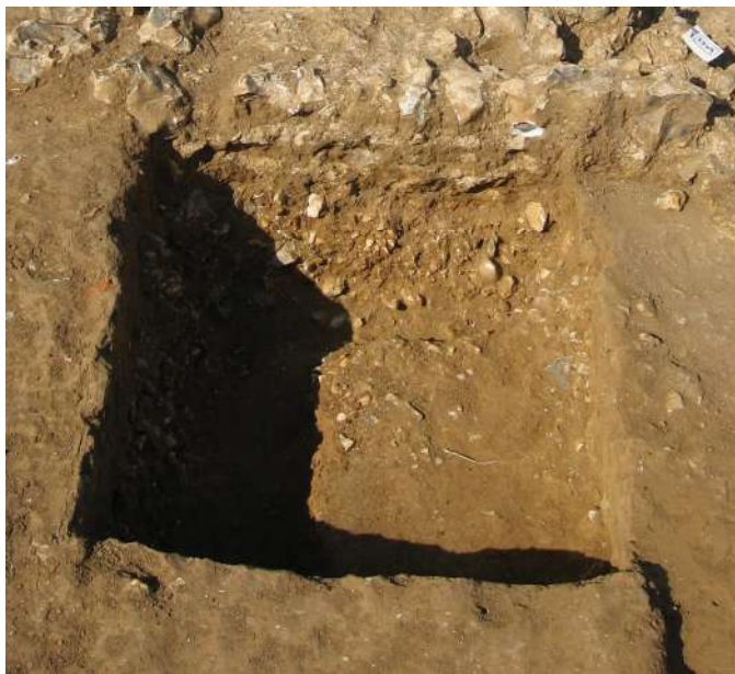
Figure 6: Trench B3 (facing north)

Trench B3 was located to the south of the apsidal wall uncovered in 2007. The trench showed clear layers of mortar between each course of flints. Under a relatively shallow layer of brick earth, the soil contained a very high percentage of flint gravel (Fig. 6).