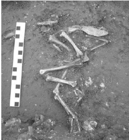
Figure 12: Chicken Skeleton uncovered (facing west)

The pit feature seems to extend for a diameter of approximately 4m and seems to have been deliberately dug in the North West corner of room 1.