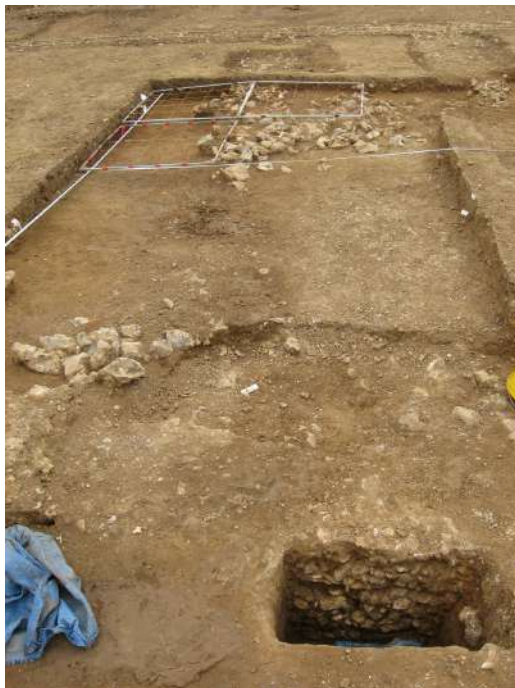
Figure 9: Trench B8 (facing east)

Trench B8 was located on a pit feature that had first been uncovered in the original 2006 (Fig. 9). The pit cut into the main western wall of the villa building, and the trench was located to investigate the extent and nature of the feature.