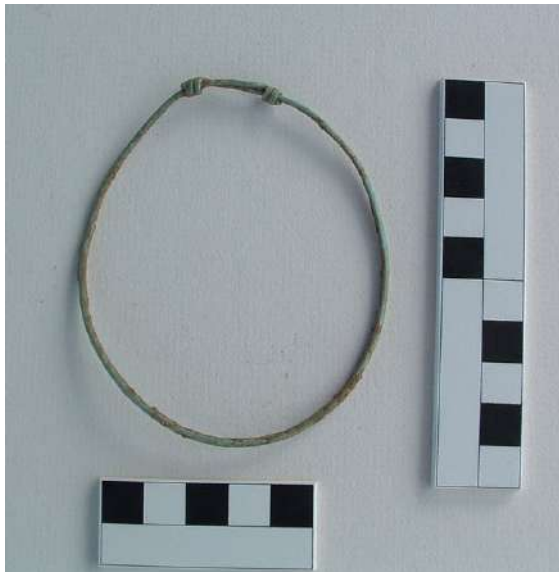
Figure 19: Copper alloy bracelet found in 2006

A number of personal finds, including the copper alloy bracelet found in 2006 (Fig. 19), the remains of two rings, one from 2006 (Fig. 20) and one from 2008, the probable toilet set implement (Fig. 21) from 2007, the bone pin from 2007 (Fig. 22) and the various brooches and pins do give us a tantalising glimpse into the lives of those who would have lived and worked in the villa in its heyday.