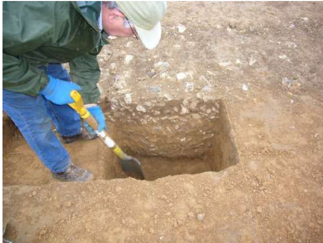
Figure 5: Trench B2a under excavation

Trench B2b showed that the external corridor wall only extended to 0.1m deep.