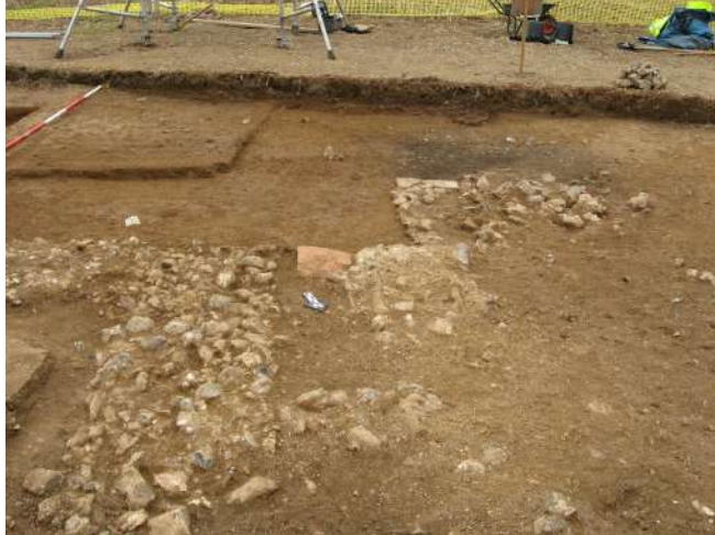
Figure 17: Possible stoke hole area (facing south)

The apsidal wall now does appear to be a bath house. The area of burning to the south of the apse (Fig. 17) appears to be related to a slightly curved wall feature leading towards the south of the apse. It is thought that this area would have held a cauldron or pan of water that would have been heated by the fire to provide the hot water for the bath house.