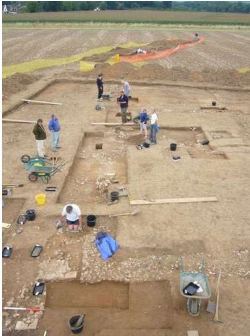
Figure 1: Excavation in process, August 2008

Worthing Archaeological Society September 2008