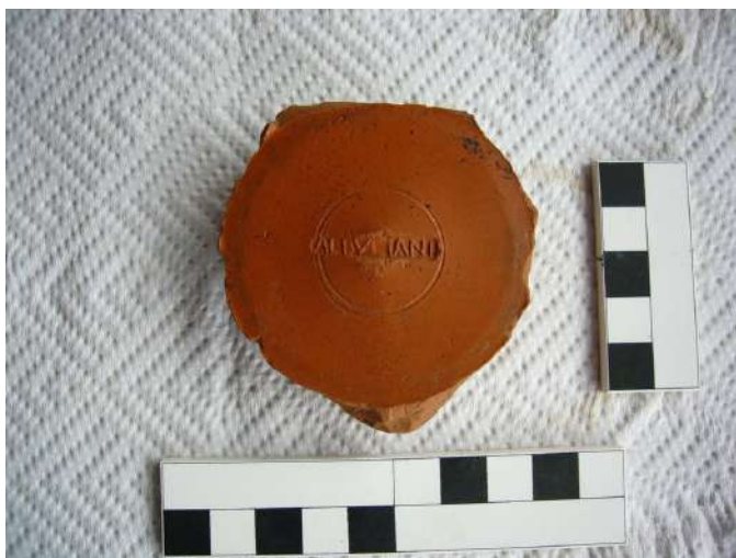
Figure 18: Stamped samian base sherd found in trench C

Included in the pottery finds was a stamped Samian base and footring sherd marked with the name “ALBVCIANI” (Fig. 18). This potter was working in Lezoux in central Gaul between 140 and 190 AD.