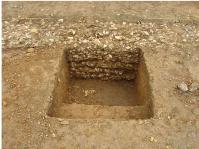
Figure 4: Trench B1 partially excavated (facing east)

Trench B1 was located inside room 1 against the centre of the east wall (Fig. 4). The trench was dug to explore the depth of the walls, and to see if there were any traces of surviving floor levels below the level exposed in the 2007 excavations.