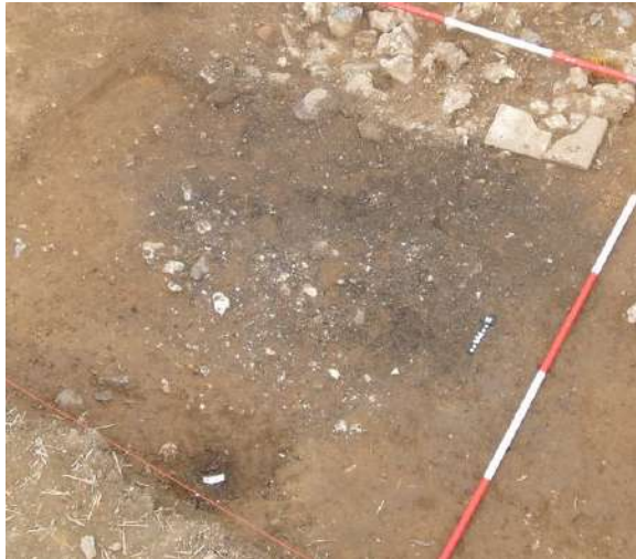
Figure 7: Trench B5 area of burning (facing north)

Trench B5 was opened at the south west of the main villa building. Trench 5 was located to investigate an area of burning that had first been discovered in 2007 (Fig. 7).